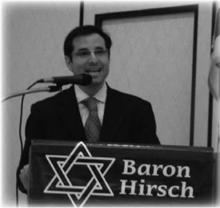
Baron Hirsch Annual Meeting & Brunch