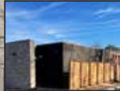
Outside of Mikvah